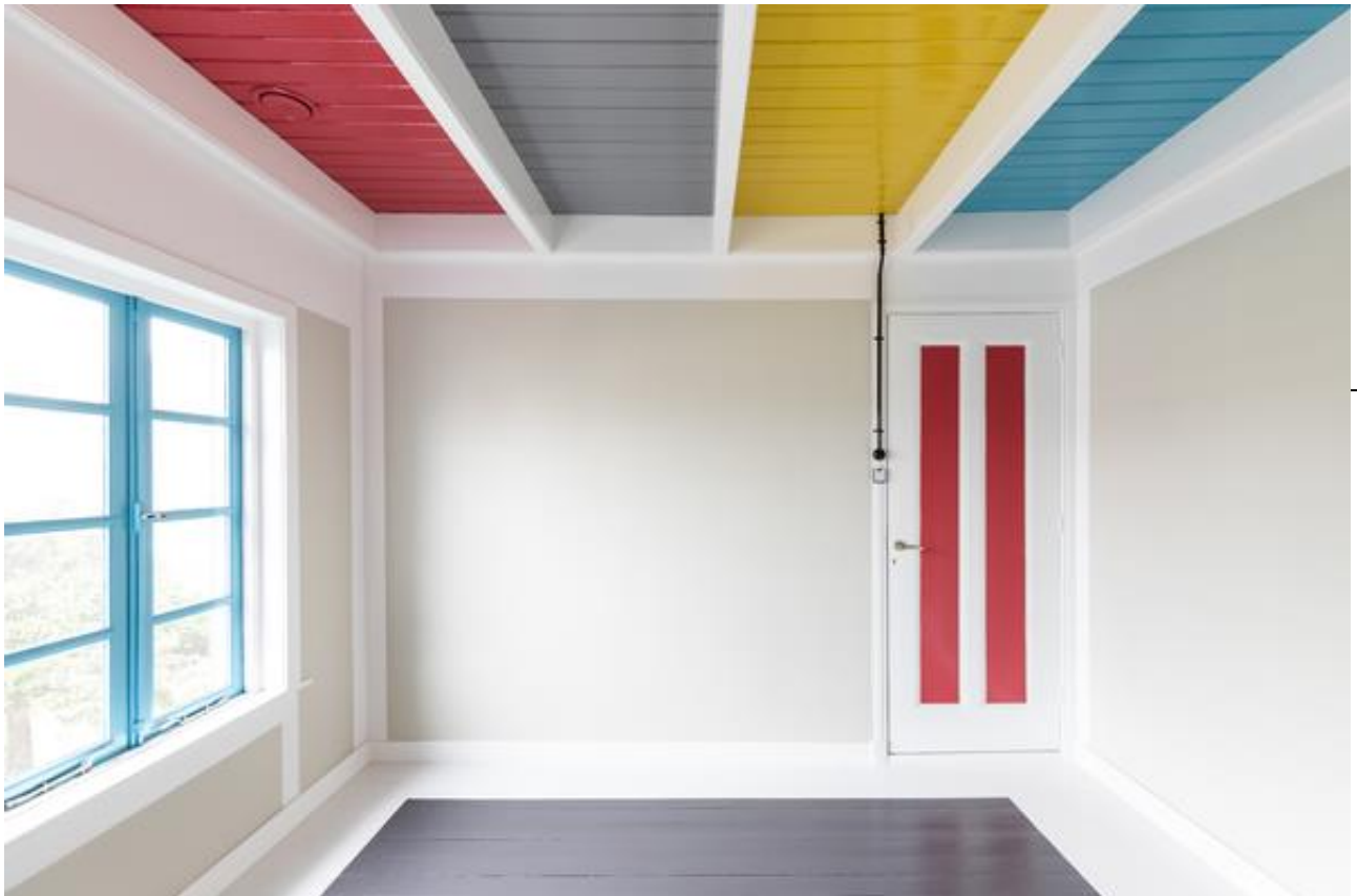
Rinsema House, bedroom 1st floor, Drachten (The Netherlands), arch. Theo van Doesburg, 1923

* This call is based upon work of the Specialist Committee of Interior Design of Docomomo International in the context of the series of debates entitled 'Modernism Frozen, Urbanism and Architecture under/after Covid-19' ( https://docomomo.be/learning-from-modern-movement-interiors-in-times-of-pandemic/ ).