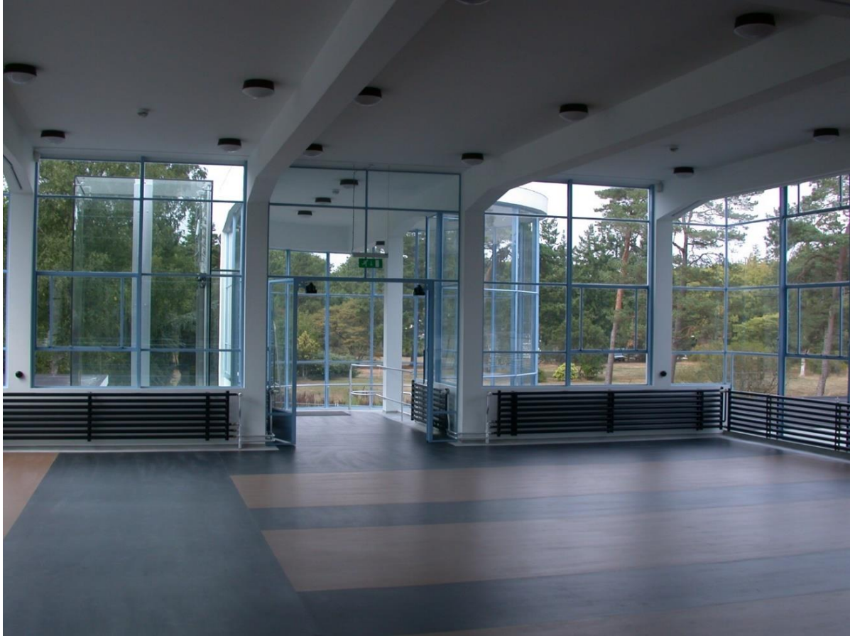
Sanatorium Zonnestraal, Hilversum (The Netherlands), archs. Duiker&Bijvoet, 1928

Having initiated an online discussion at the Tokyo Congress in 2021 'Modernism Frozen, Urbanism and Architecture under/after Covid-19: Learning from Modern Movement Interiors in Times of Pandemic' *, organized by Docomomo International, it was clear that the short and long term and small and large-scale effects necessitated further discussion as new pieces of information were discovered.